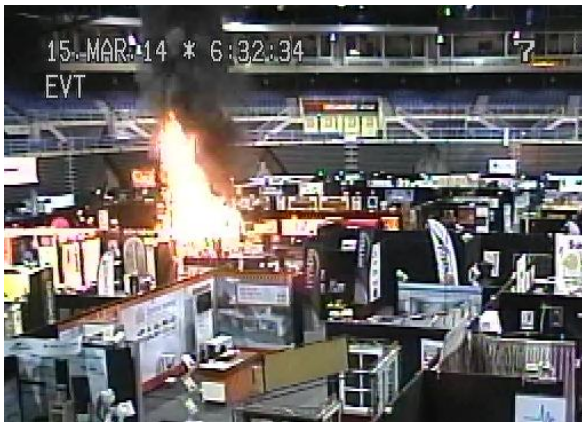
Above: the developing fire prior to sprinkler activation.