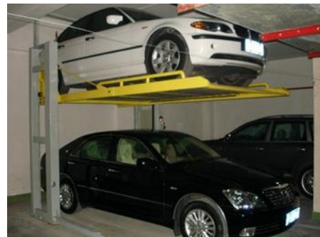
Figure 1 – Manual car stacker system

Cars are parked (one at a time) onto the platform; the hoist mechanism is then manually operated using an individual switch.