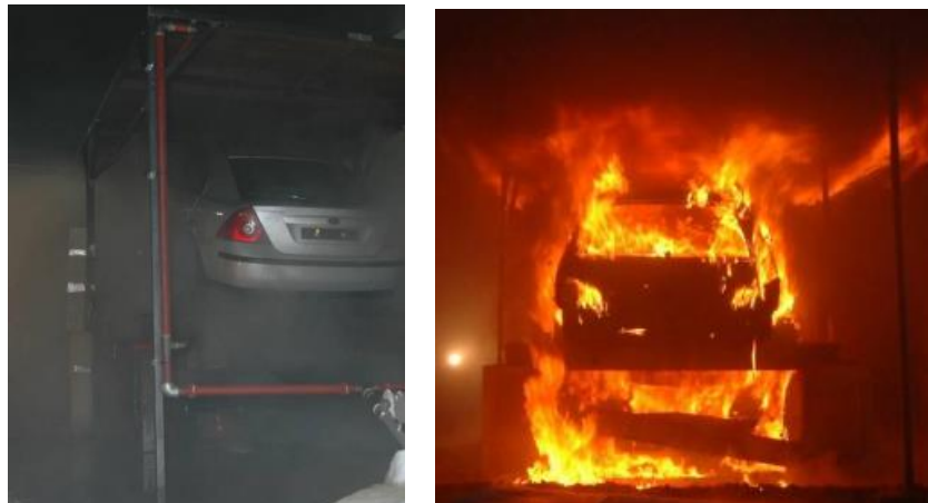
Figure 5 – Conditions in test fires utilising stacked cars