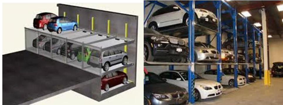
Figure 2 – Examples of semi-automatic car stackers

Operation is similar to manual systems but may be semi-automated. Some systems have a pit, with cars stacked above and below ground level.