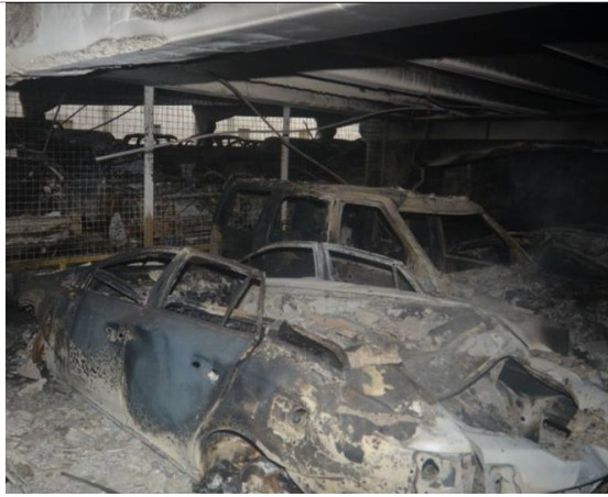
Figure 4 – The aftermath of a fire involving closely stored cars.