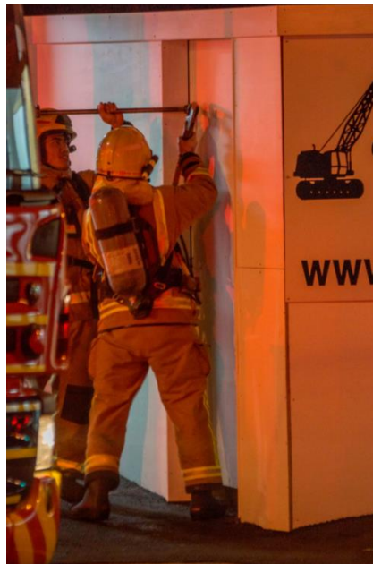
Figure 2 – Firefighters forcing entry to a secure work site

We have tools to open or remove site barriers and security features to gain access to sites, and legislative powers (under section 42 of the Fire and Emergency New Zealand Act 2017) to do this at a fire call. However, time we spend gaining access to a site will delay firefighting operations.