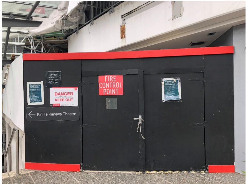
Figure 5 – Clear signage and access to fire systems on a refurbishment site

During demolition, the hydrant system should remain operational up to the floor below the highest intact floor (NZS 4510:2008 paragraph 8.4).