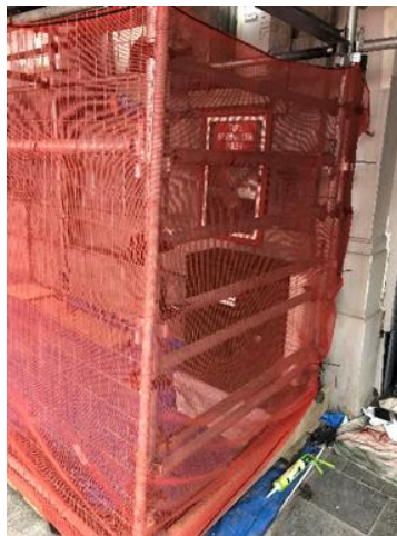
Figure 4 – Building refurbishment that hasn't considered panel/inlet access