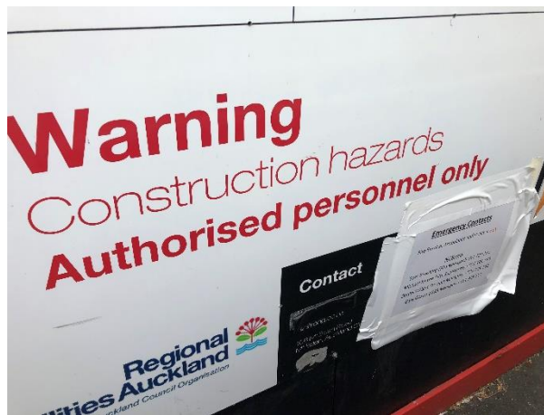
Figure 6 – Key contact lists at entry to a construction site