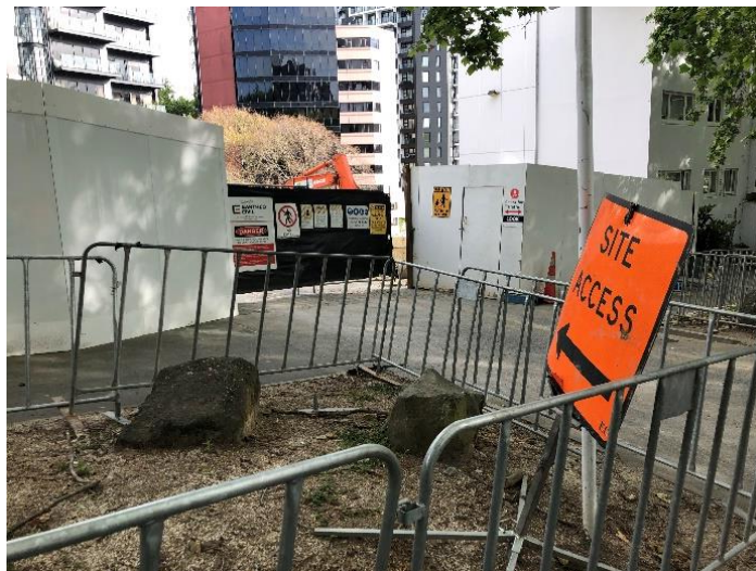
Figure 1 – Site access signage

Site access point (SAP) signage can help direct us.