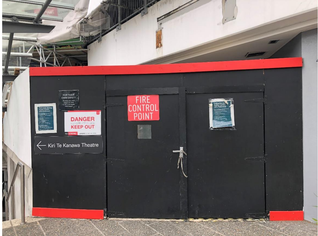
Figure 5 – Clear signage and access to fire systems on a refurbishment site

It's very important that you tell us about any shutdown because this affects what resources we send if there's a fire on your building/site. We send fewer resources to fully sprinklered buildings because we assume that a fire in a sprinklered building with fully operational systems will be controlled and we'll need fewer resources than for an uncontrolled fire in a non-sprinklered building. If you tell us that you've shut down your system, we'll know to send appropriate resources.