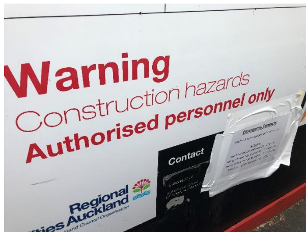
Figure 6 – Key contact lists at entry to a construction site