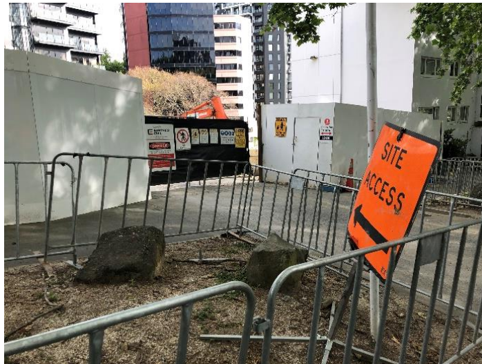
Figure 1 – Site access signage

Site access point (SAP) signage can help direct us.